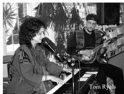
BluesWorks in Concert

Each year the Library Trustees mount a mailing to raise funds for the operation of the Library. Remember that the Northumberland Public Library is only one of about 13 libraries in the state that is owned by the community, not the county government, although the county contributes to the annual budget. That is why the Library counts on the community for support.